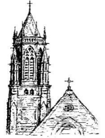
ST PAUL'S BRIGHTON